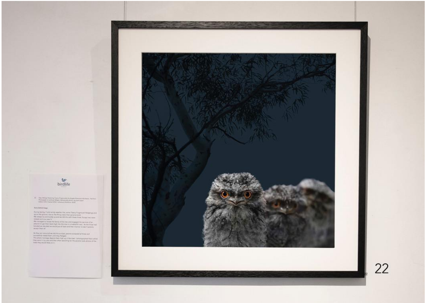
22. Step Siblings (featuring Tawny Frogmouths) by Angela Robertson-Buchanan, 70x70cm. Photograph on archival 320gsm Hahnemuhle photo rag pearl paper Edition 2/25, Framed: $765, Unframed (55x55cm): $330